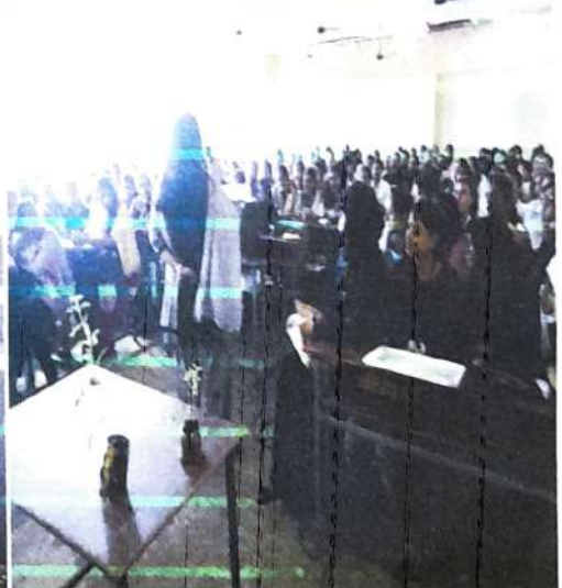
Lecture by Doctor